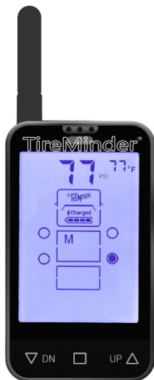
5 TH Wheel 4 Tires

The TM77 has the ability to add up to 22 tires. As it is unlikely you will use all 22 positions, below you will find some recommendations of where to add tire positions. Ultimately, it is up to you to decide how you would like the TM77 to look. So have fun with it!