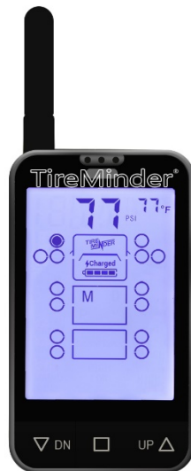
MotorHome, Toy Hauler and Boat 14 Tires