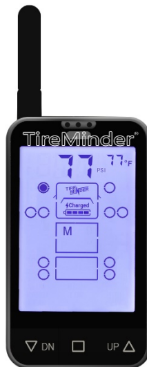
MotorHome and Tow Car 10 Tires