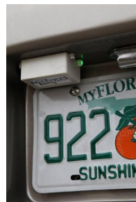
Attached to License Plate Light