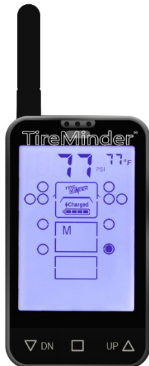
Dually Truck and 5 TH Wheel 10 Tires