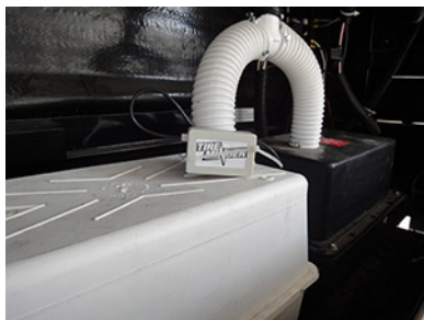
Inside Battery Compartment