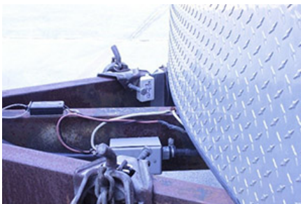
Front of Car Hauler